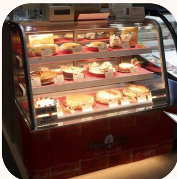
← Non-Freon counter showcase