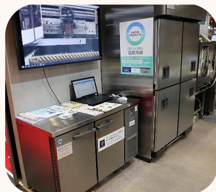
↑ Non-Freon refrigerator / freezer Sliding door refrigerator (4-door type)